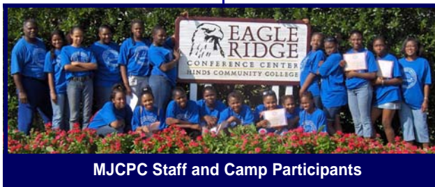
MJCPC Staff and Camp Participants

While students were enjoying summer vacation, Metro Jackson Community Prevention Coalition (MJCPC) staff was hard at work preparing for this year's Summer Teen Camp held at Eagle Ridge Conference Center from July 10-14.