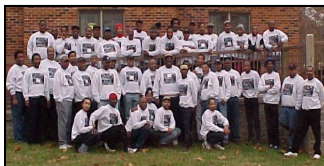
Brothers United Winter Retreat Participants

The 4th Annual Brothers United Winter Retreat was held this past December in Wildersville, Tenn. at Natchez Trace State Park. The site was the perfect place for brothers to gather and celebrate the great works and achievements done in the year 2000. This event is a collection of volunteers and friends from Brothers United chapters in Nashville, Chattanooga, Memphis, Knoxville, and West Tennessee.