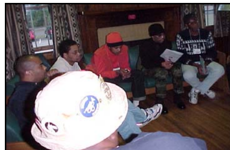
JSU MURC Community Mobilization Workshop

Having the opportunity to attend the seminar on Community Mobilization sponsored by the Jackson State University