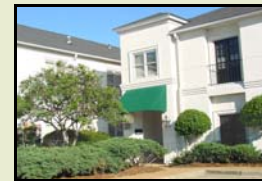
Mississippi Urban Research Center

The Mississippi Urban Research Center (MURC), a division of Jackson State University's Office of Research Development and Support and Federal Regulations, has a mission to improve the quality of life through the conduct of basic and applied research and policy analysis and provide insight on solutions to urban problems.