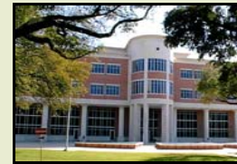
H. T. Sampson Library

Jackson State University is the fourth largest institution of higher learning in Mississippi and the only public four-year institution in the central Mississippi area.